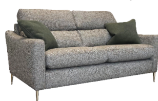
2 Seater Motion Lounger