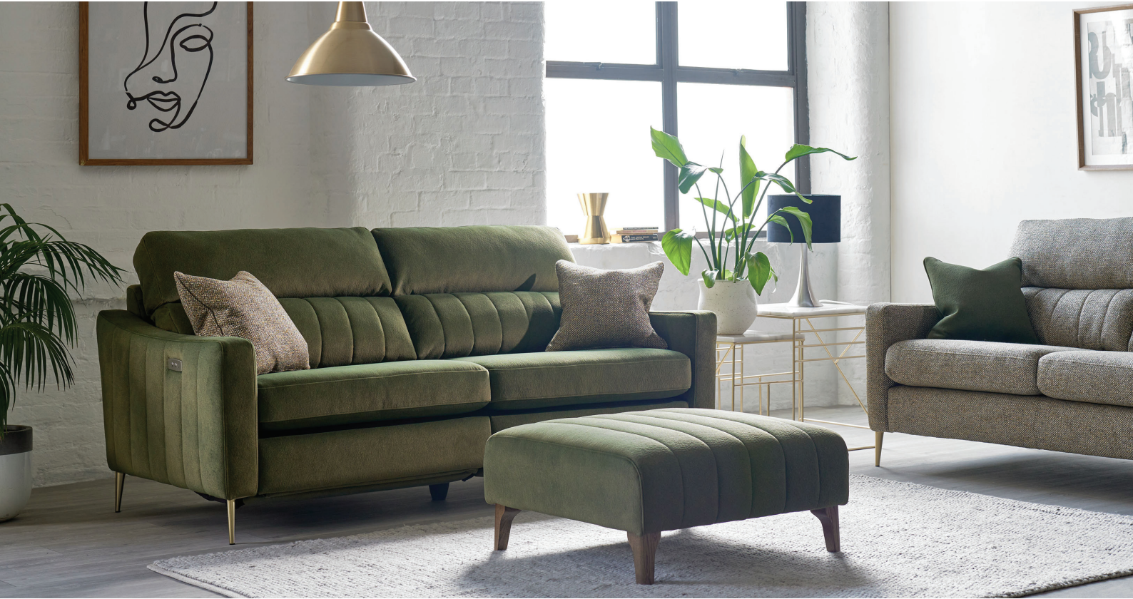
Image shows 3 Seater Motion Lounger and Stool in Suave Olive with 2 Seater in Great Lime. Feet are Brushed Brass and Smoke wood.