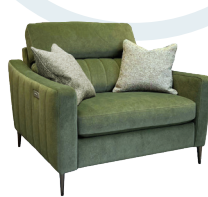
Cuddler Motion Lounger