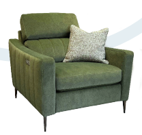
Chair Motion Lounger