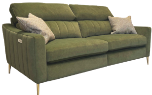
3 Seater sofa